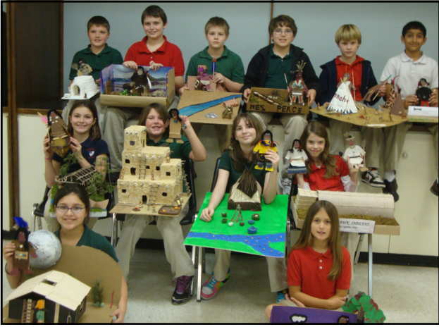
Fifth grade students shared their Native American Indian displays and research with students and guests on January 27th.